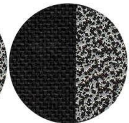
Fabric: Black 21 Frame: Silvervein 11