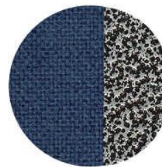
Fabric: Dark Blue 05 Frame: Silvervein 11