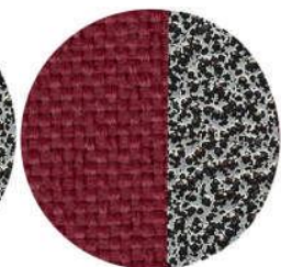
Fabric: Maroon 16 Frame: Silvervein 11